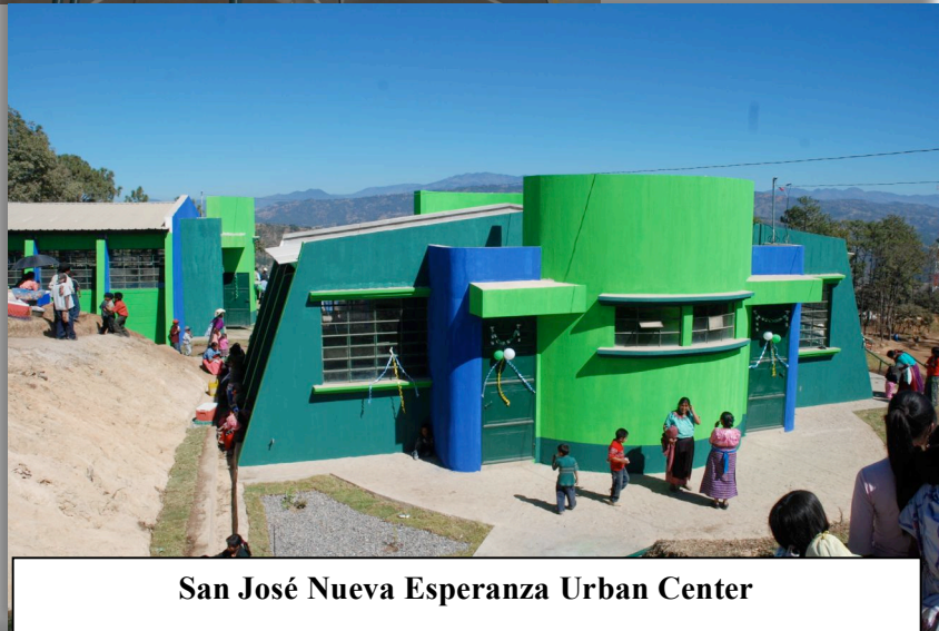
San José Nueva Esperanza Urban Center