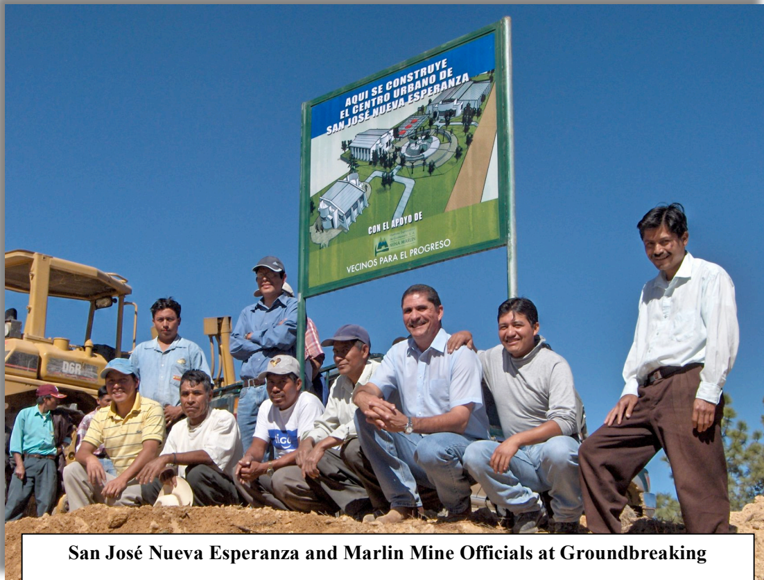
San José Nueva Esperanza and Marlin Mine Officials at Groundbreaking

In December of 2007, San José Nueva Esperanza and Marlin Mine officials broke ground on the new urban center. Construction proceeded over the next 12 months and on December 10, 2008; the urban center was completed and transferred to the community. The Guatemalan Ministry of Energy and Mines (MEM) Vice Minister for Sustainable Development and the MEM Mining Director attended the transfer ceremony and celebration along with community leaders and the Mayor of San Miguel Ixtahuacán.