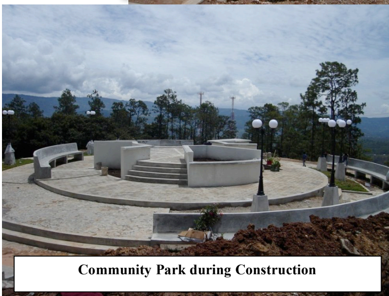
Community Park during Construction