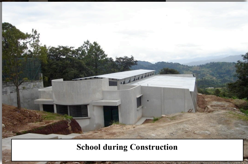
School during Construction