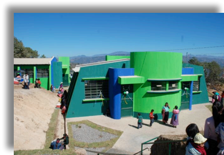
San José Nueva Esperanza Urban Center Community of San José Nueva Esperanza Montana Exploradora de Guatemala, S. A.