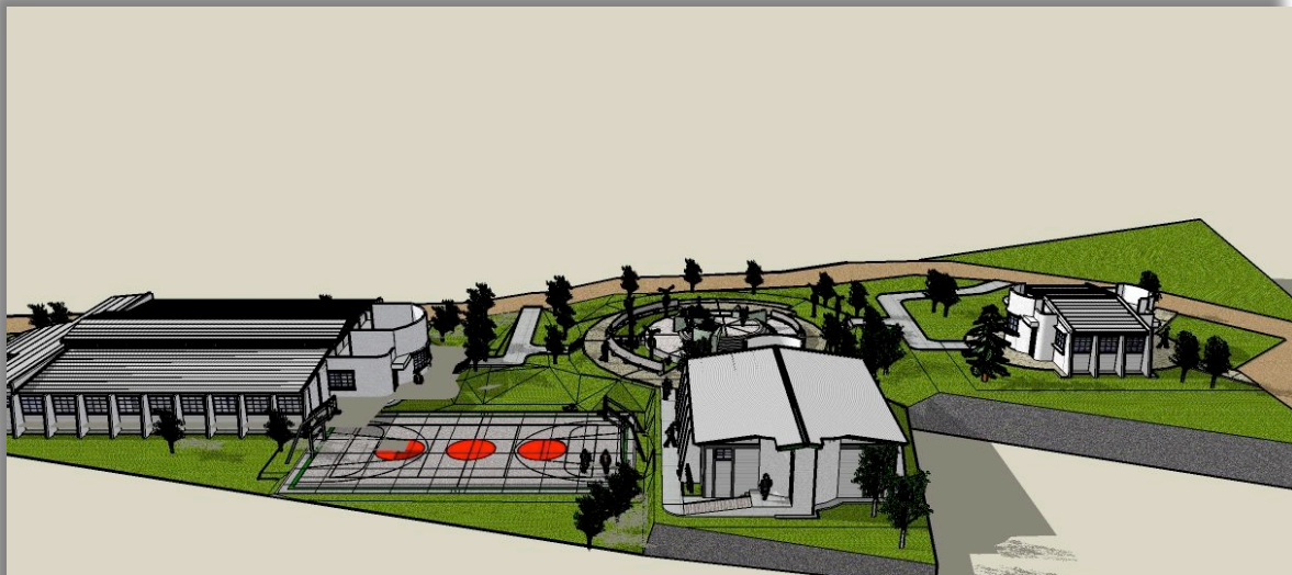
Architectural Drawing: San José Nueva Esperanza Urban Center