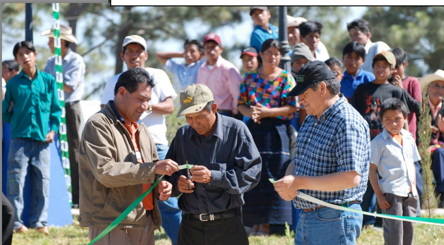
San Miguel Ixtahuacán Mayor, San José Nueva Esperanza Official and Marlin Mine Manager at