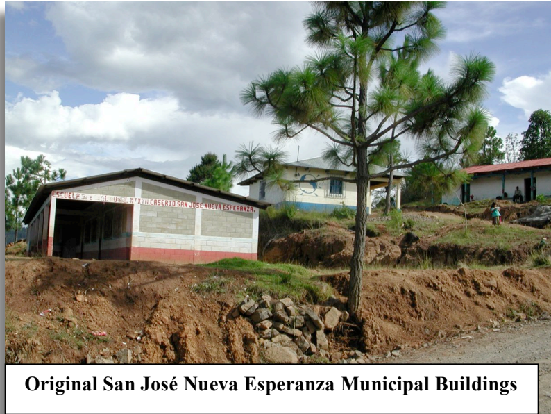
Original San José Nueva Esperanza Municipal Buildings

Over the next two years, Nueva Esperanza community leaders and Marlin Mine Sustainable Development Department staff worked on a design for the Auxiliary Mayor's Office, including a room for immunizations and other health care services, a community meeting hall and a school, along with a new playground and community park. The design included water, electrical and a septic system for wastewater. A free-standing kitchen was added to the design after construction began.