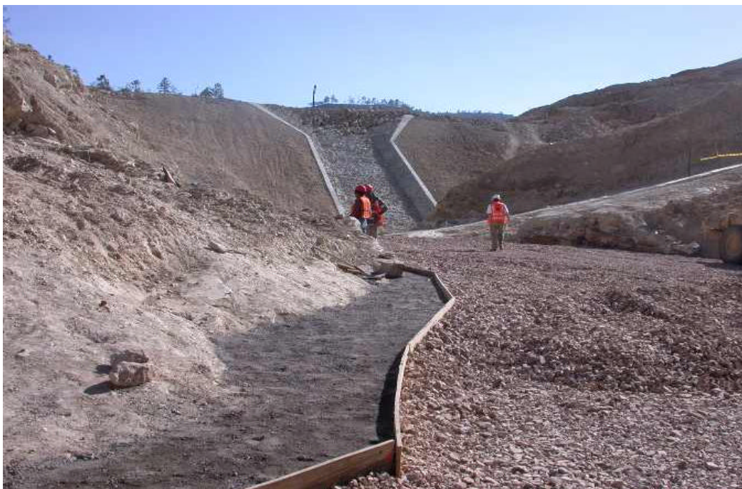
Photo C-10: February 21/22, 2004, Main Drain – Showing Filter Placement on Sides of Drain Rock