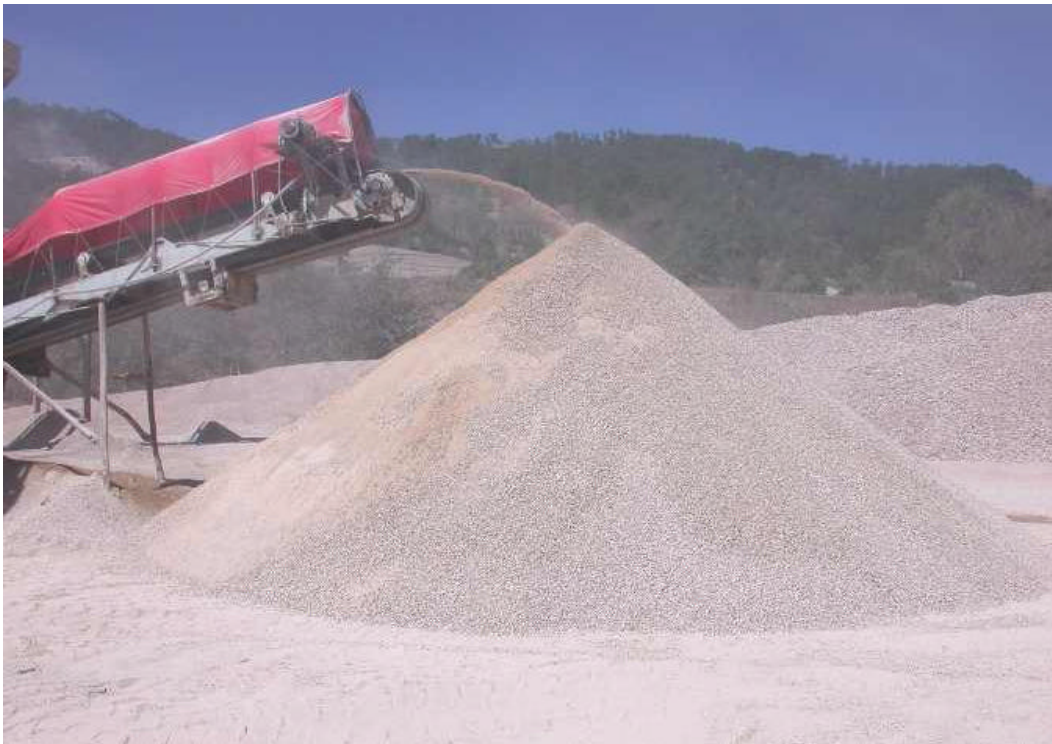
Photo C-11: February 21/22, 2004, Segregation of Filter Material Observed on Live Stockpile