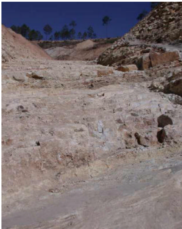
Photo C-3: February 21/22, 2004, Right Abutment Core Trench Foundation Prior to Dental Concreting