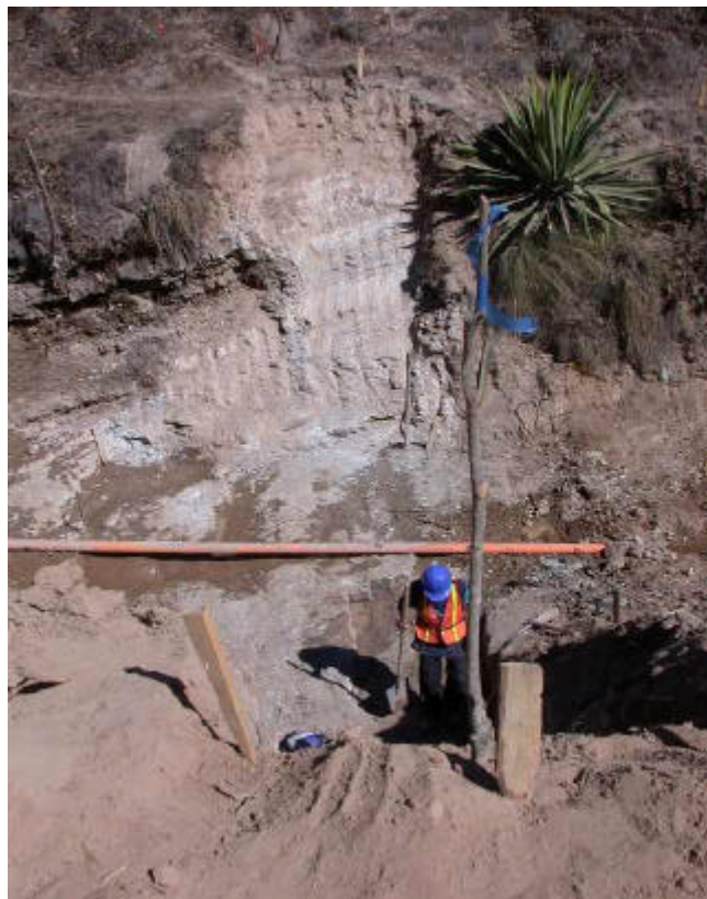
Photo C-13: February 21/22, 2004, Excavation Into Bedrock for Monitoring Weir