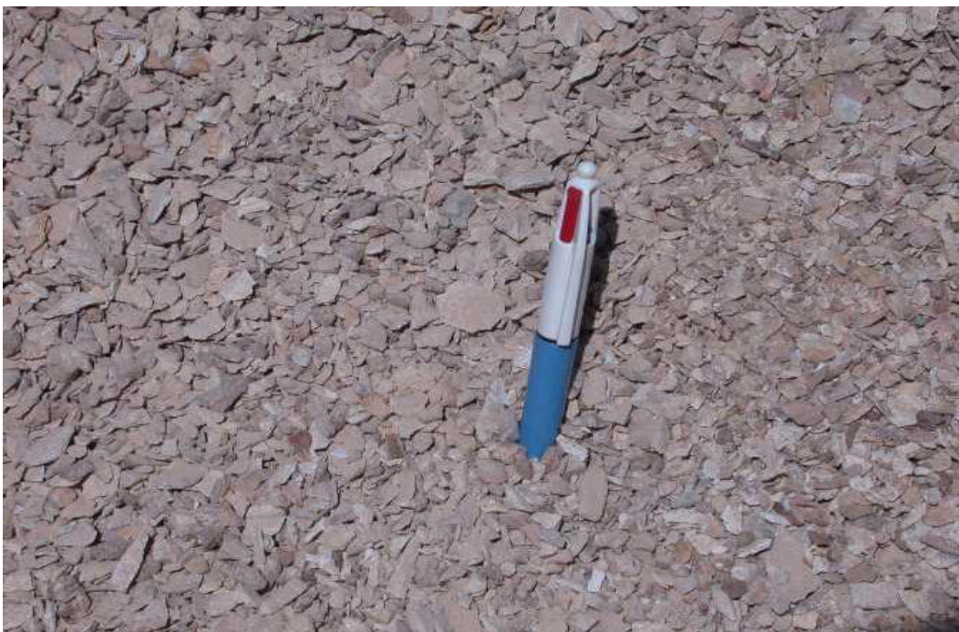
Photo C-12: February 21/22, 2004, Low Fines Segregated Filter Material