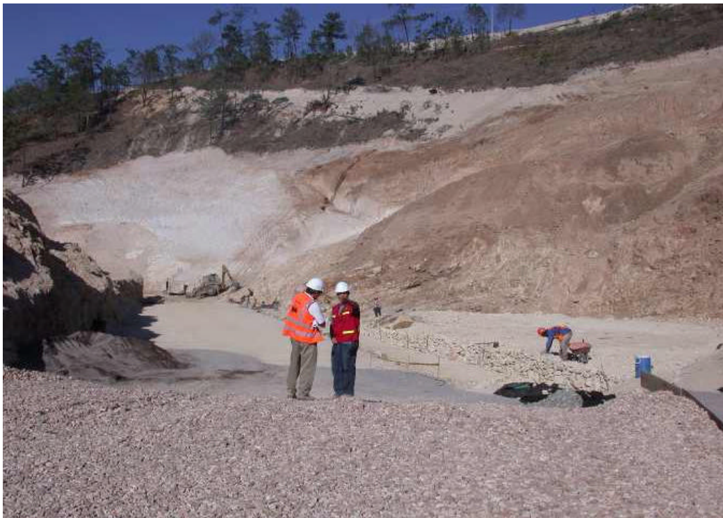
Photo C-9: February 21/22, 2004, Main Drain - Drain Rock on Filter Layer