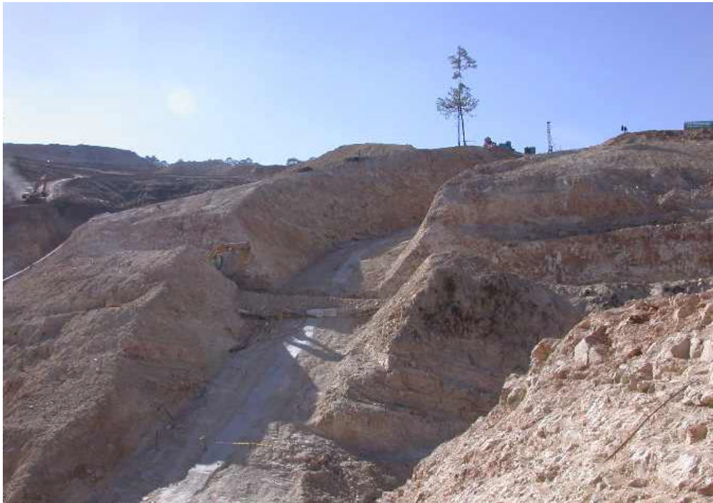
Photo C-5: February 21/22, 2004, Left Abutment Lower Core Trench w Grout Cap and Low Level Outlet Pipe Trench