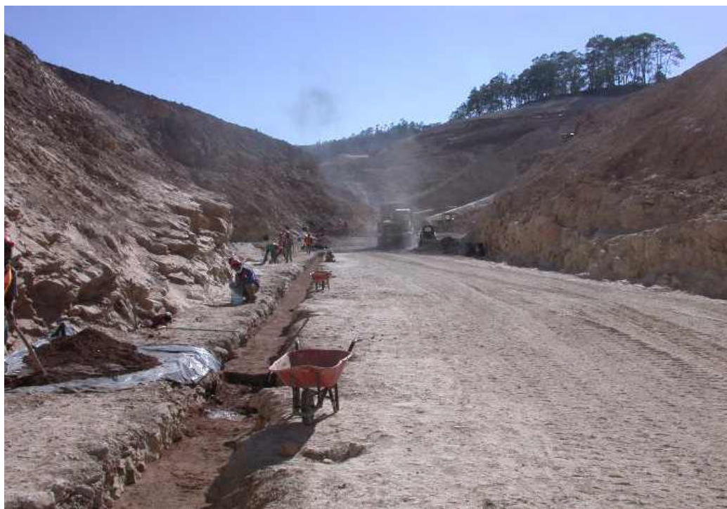
Photo C-8: February 21/22, 2004, Downstream Valley Base with Instrument Trench