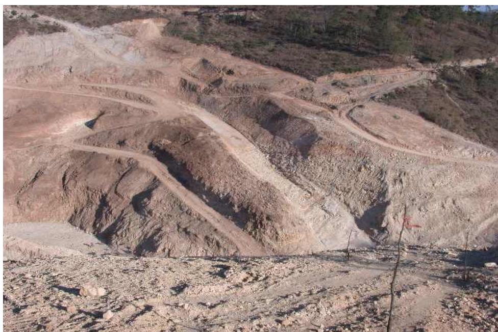
Photo C-2: February 21/22, 2004, Right Abutment Core Trench and Foundation