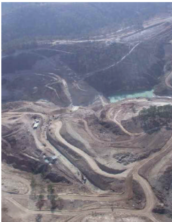
Photo C-1: February 21/22, 2004, Overview of Cofferd Dam and Foundation Excavations